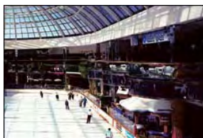
Ice Palace (Skate rental is not included)

OR any TWO of the following on the same day: