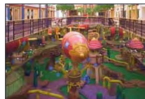
One Round (18 holes) of Professor Wem's Adventure Golf