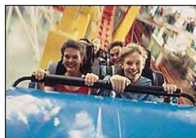
Day pass to Galaxyland Amusement Park

OR any TWO of the following on the same day: