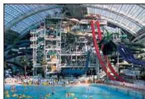
Day pass to World Waterpark

A Choice Pass allows the bearer to enjoy ONE of the following (passes expire in 1 year)