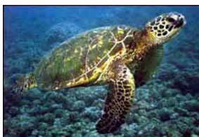
Sea Life Caverns