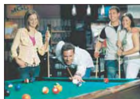
Two games of bowling or one hour of billiards (shoe rental not included) at Ed's Rec Room